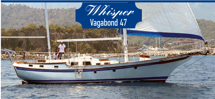
Whisper Vagabond 47