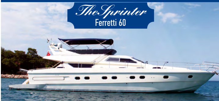
The Sprinter Ferretti 60