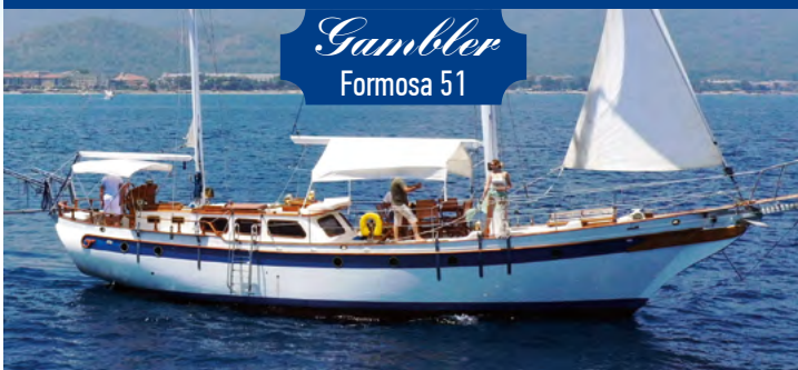
Gambler Formosa 51